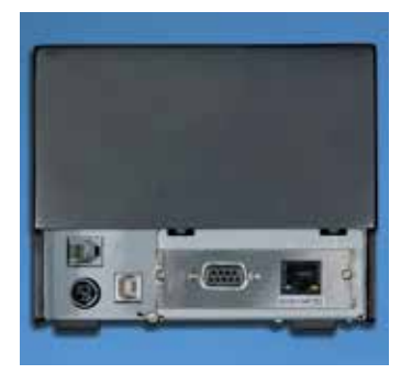
Recessed Connections – Variable Interface Options Available