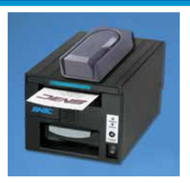
Easily Supports Other Devices, Optimizing Footprint