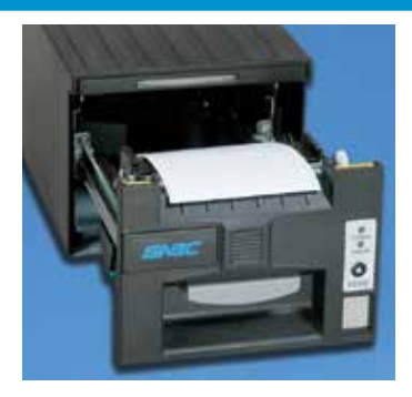
Slide Open For All Operator Tasks Including Drop and Print Paper Loading