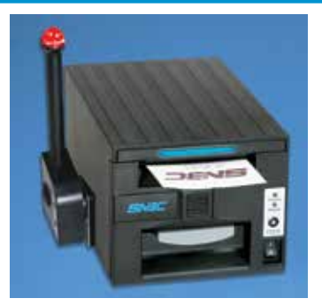
Optional Audio/Visual Print Messenger